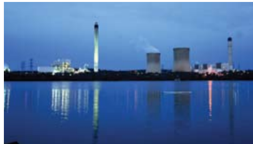
Water from the Wivenhoe-Tarong Pipeline is used to generate electricity at the Tarong and Tarong North power stations.