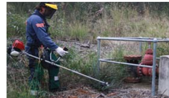
A maintenance team member clears weeds around the pipeline.

We may need to eradicate weeds around the pipeline. We will consult with you before using chemical sprays for weed control on the easement area.