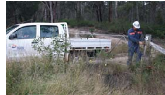
Our maintenance teams always close gates after entering or exiting a property.

We understand the importance of security on rural properties. We will return locked gates to the way they were when we arrived. If your property is secured by a locked gate and we have not been provided with a key, we will cut the chain (not the lock) and insert an interlinking series lock, to allow us to access the property while maintaining your security.